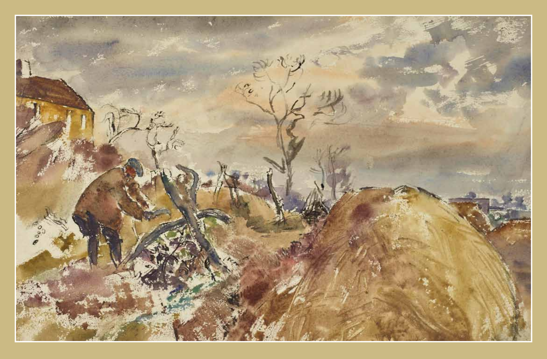
Clearing the Orchard, Eldridge Farm, Ridley Watercolour 29 x 47cm