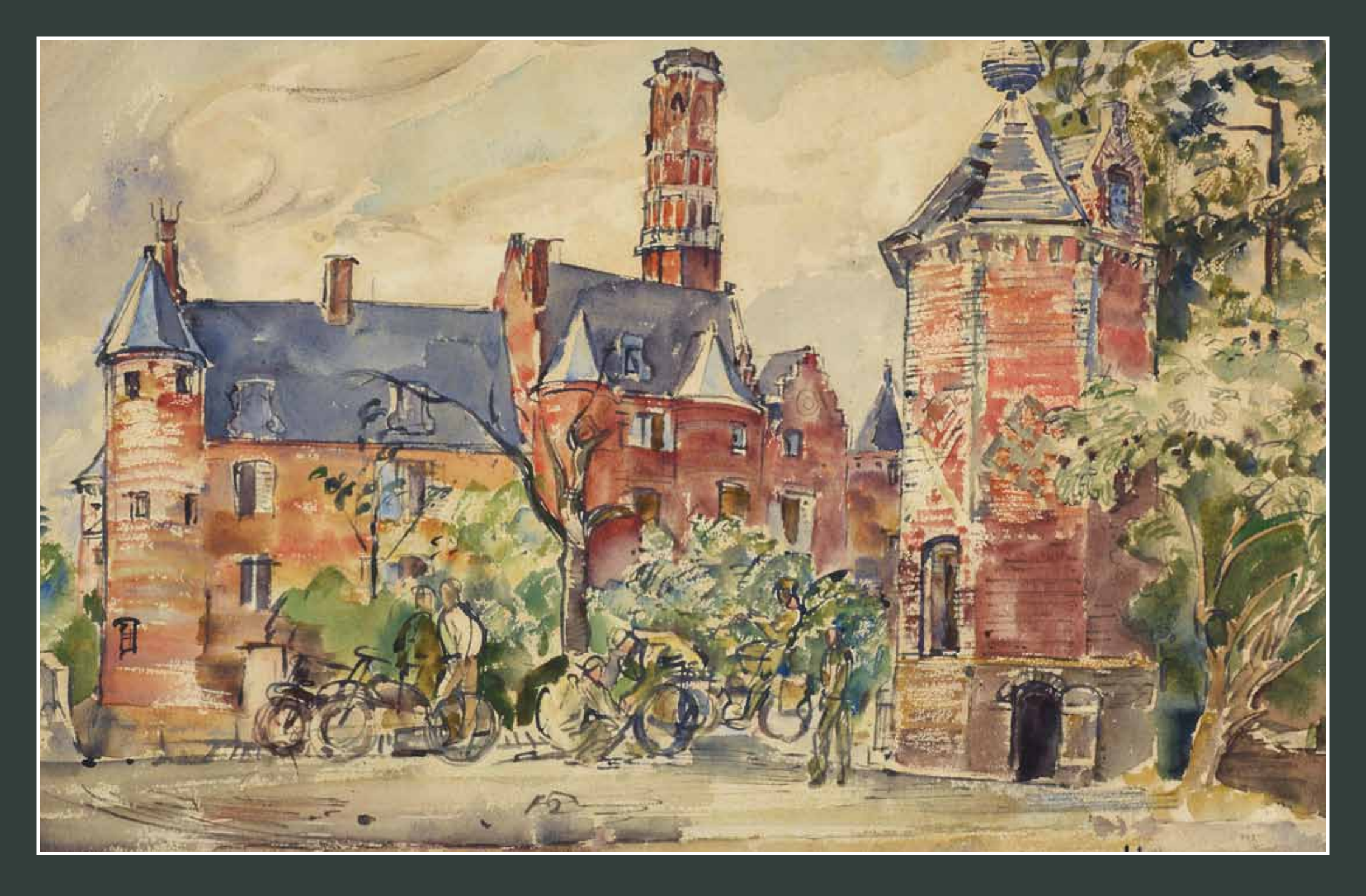
Chateau D'Esquelbecq, Nr Dunkirk 1944 Watercolour 32 x 45cm