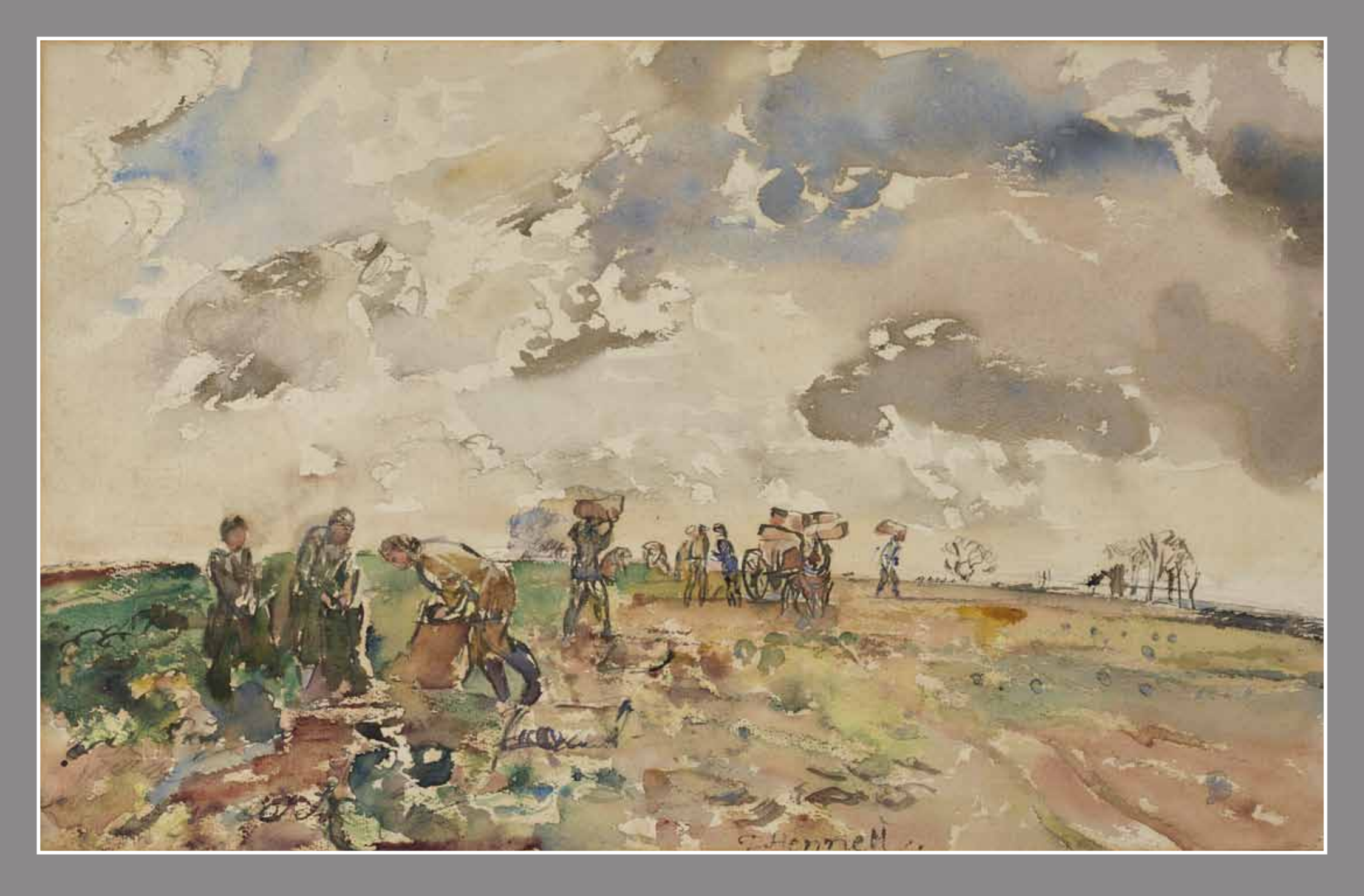
Spring Cabbage - Picking Winter Greens Watercolour 29 x 47cm