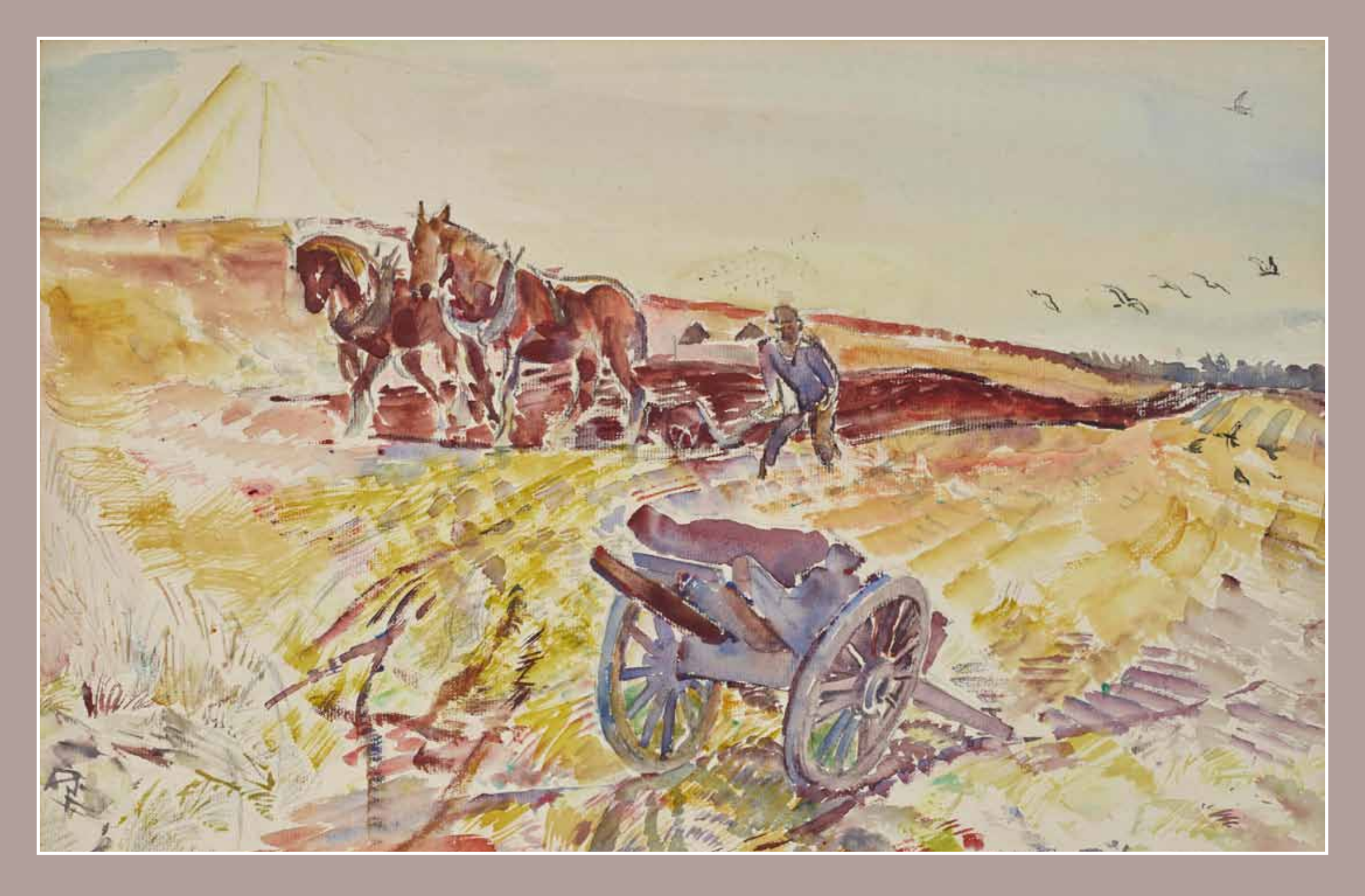
Ploughing, with sunburst Watercolour 30 x 47cm