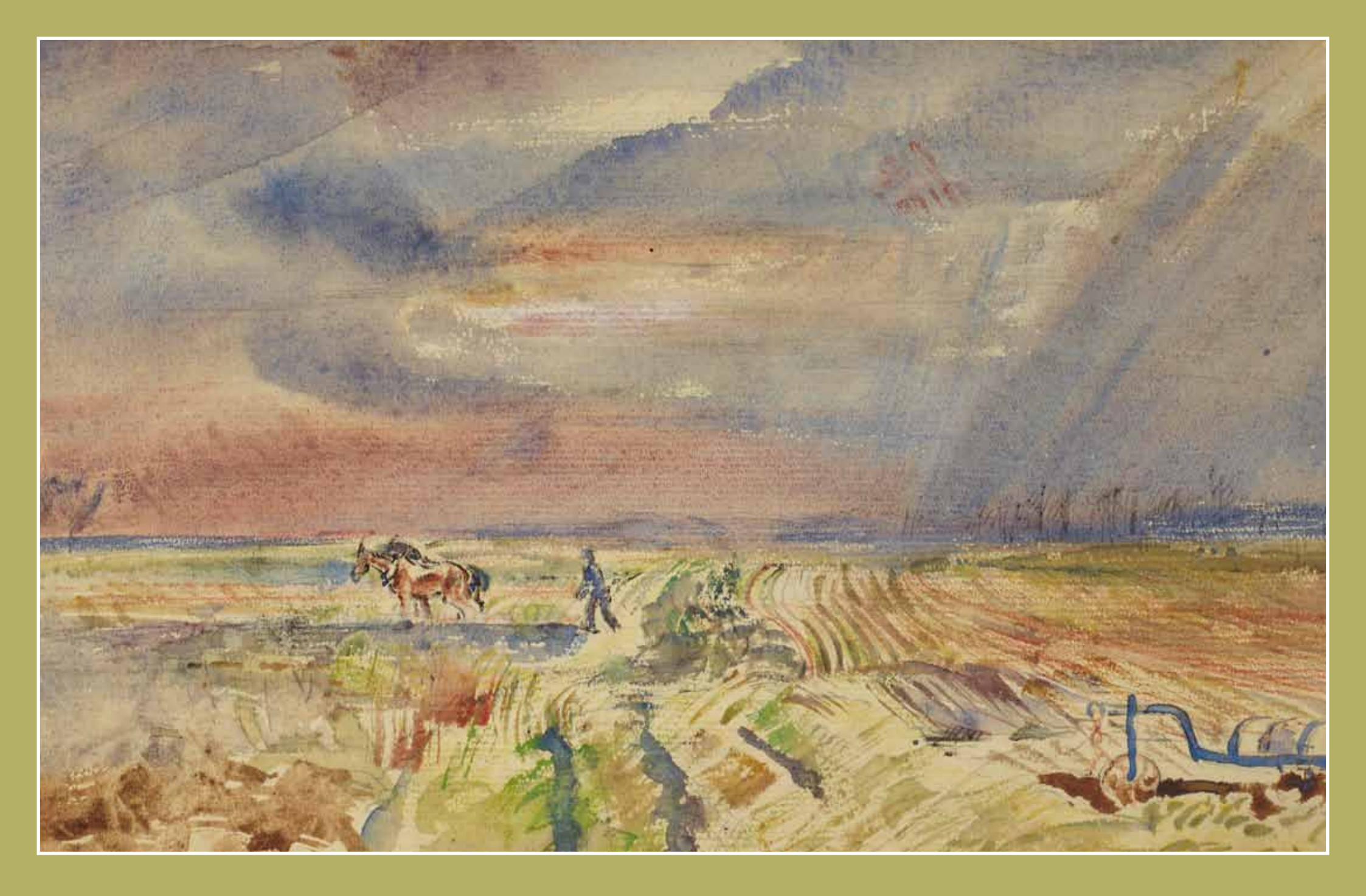
Working a pair of horses Watercolour 19 x 30cm