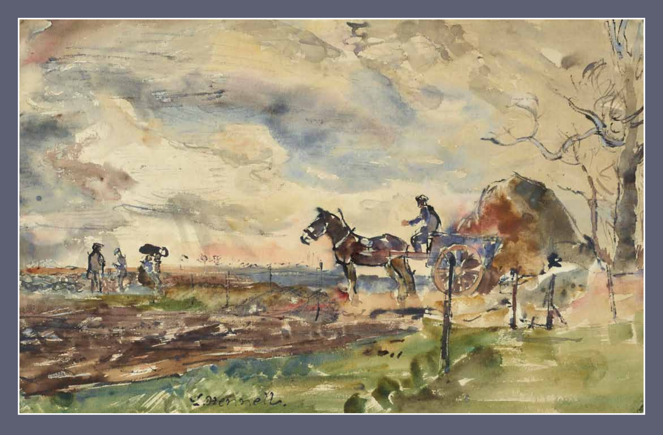
Horse and Cart, with figures, Ridley Watercolour 30 x 48cm