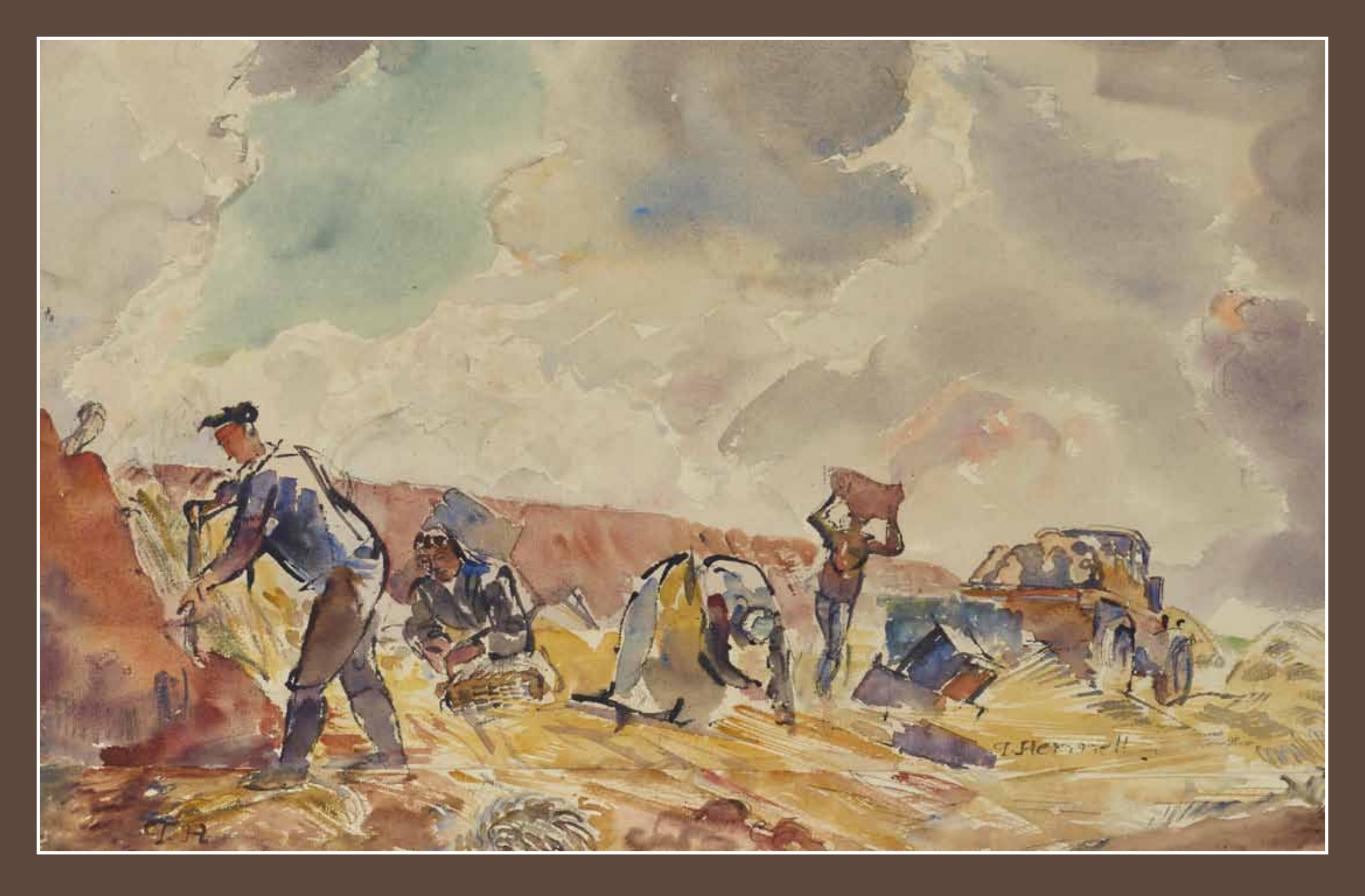
Bagging potatoes, Ridley Watercolour 34 x 47cm