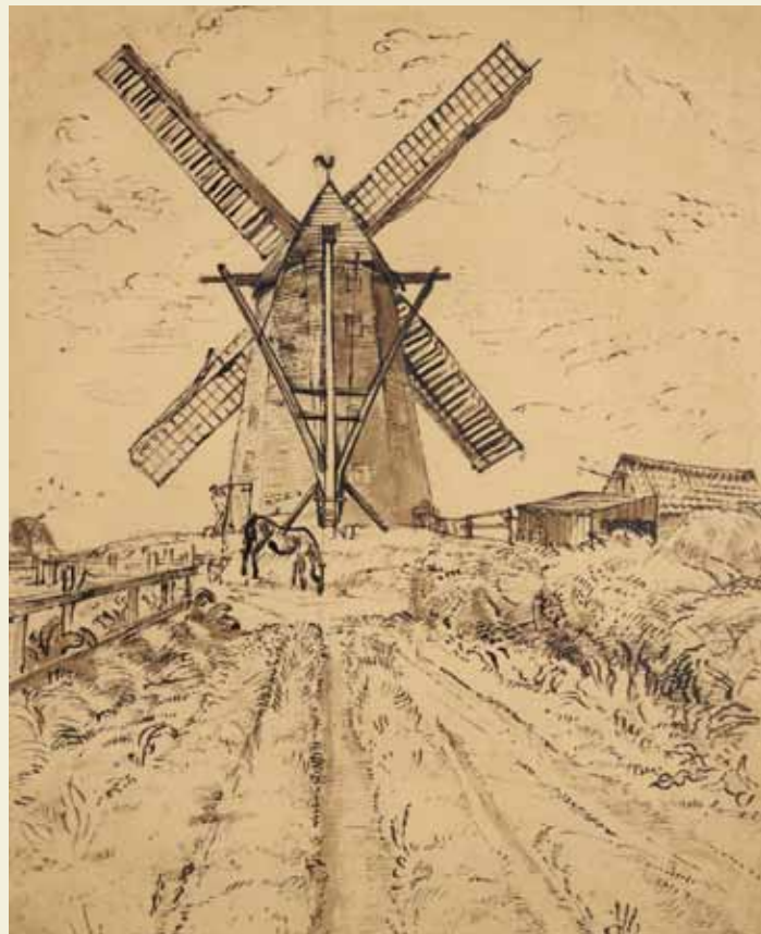
Wymondham North Mill, Norfolk Reed pen Online CAT. 28