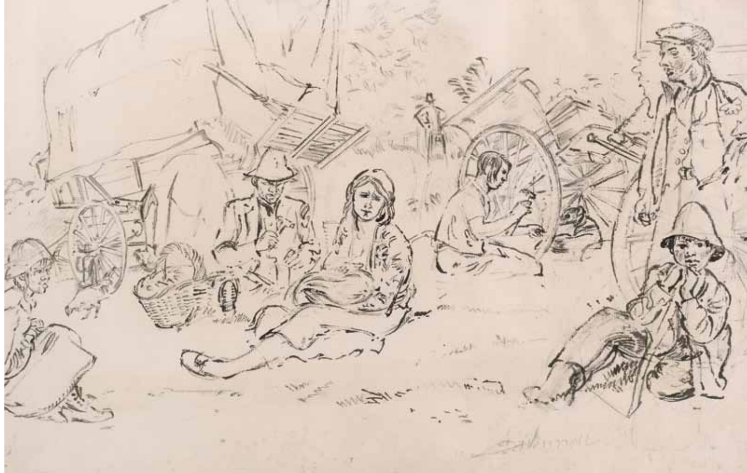
Gypsy Encampment Reed pen Online CAT. 30