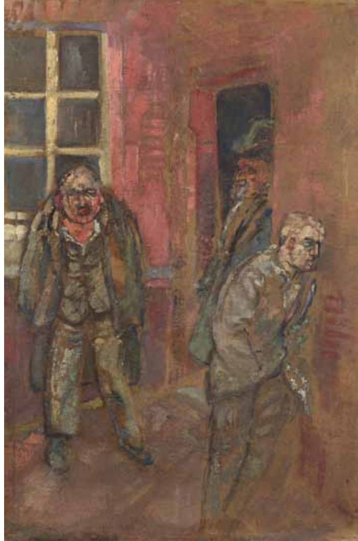
The Orator Oil on canvas Online CAT. 5

Despite Hennell's well documented history of psychosis, there is very rarely any visual indication of madness. The vast majority of Hennell's work, even from his periods of incarceration, is based on a shared reality. In fact, his drawings of life in mental hospital are all too disturbingly