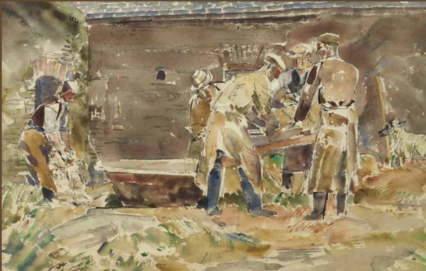
Sheep Dipping Watercolour Online CAT. 23