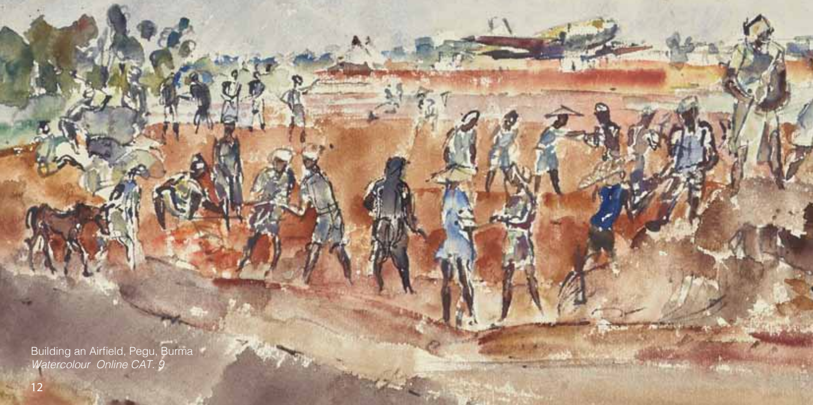
Building an Airfield, Pegu, Burma Watercolour Online CAT. 9