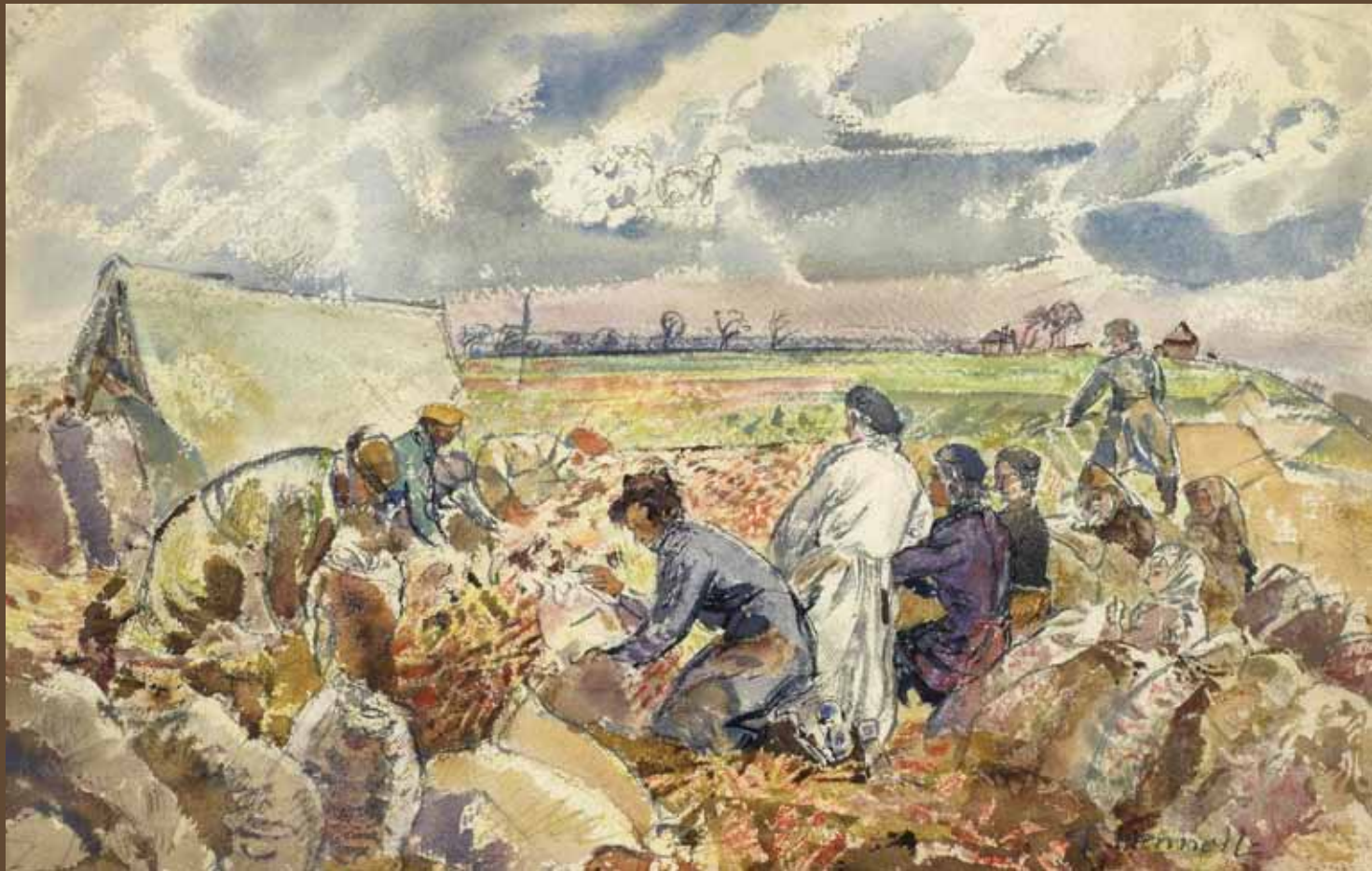
Wartime Fieldworkers Sacking Carrots (with Tent), Ridley Watercolour Online CAT. 17