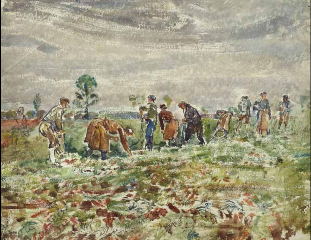
Digging Carrots Watercolour Online CAT. 6