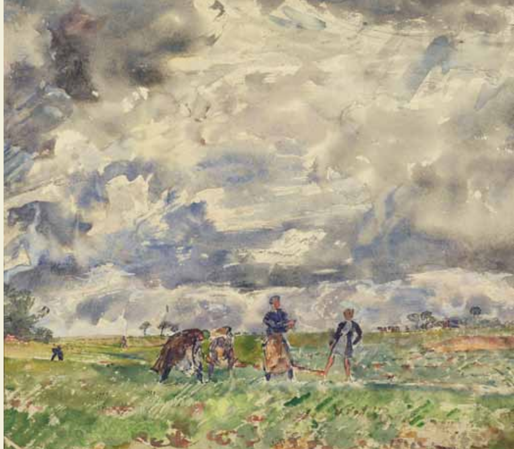
Fieldworkers against a Louring Sky Watercolour Online CAT. 20